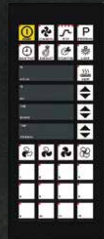
四檔風速面板 Four-speed wind speed panel