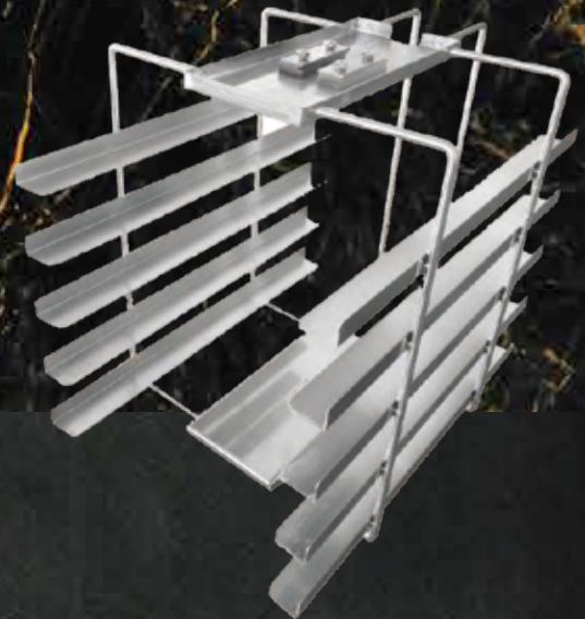
可拆式內爐架 Detachable tray rack